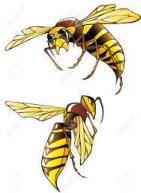
Wasp & Hornet Spray "They will return"!!!