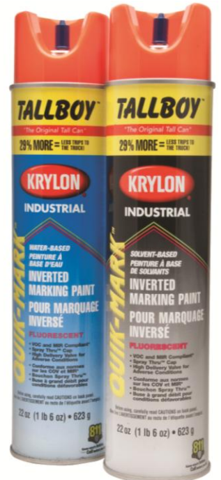
Inverted Marking Paint