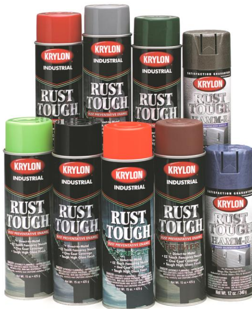
Aerosol Paint Many Colors, Types & Formulas